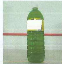
g. Dishwashing Liquid, 1.5L bottle