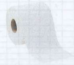
k. Tissue (12 rolls/pack)