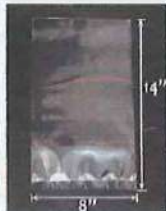
c. Autoclavable plastic pp bags, 8x14", (0.0018-0.002)