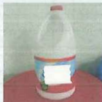
f. Bleach (3785 ml per bottle)