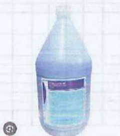
i. Ethaclean (for cleaning of glass distiller) per gallon