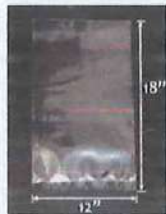
d. Autoclavable plastic pp bags, 12x18", (0.0018-0.002)