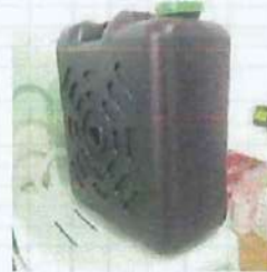
h. Ethyl Alcohol 20L capacity Jerry Can, 90-95%