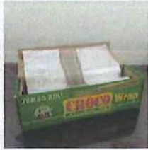
a. Aluminum Foil, thick, large, roll 100 m