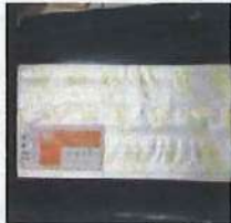
b. Autoclavable plastic pp bags, 6x12", (0.0018-0.002)